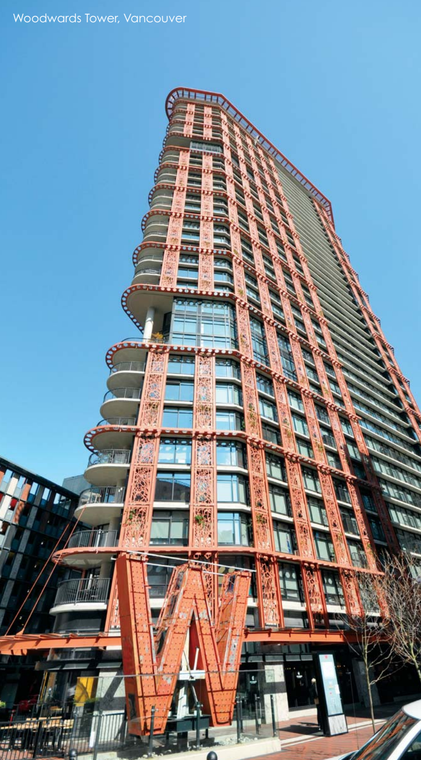
Woodwards Tower, Vancouver